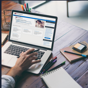
MY BUSINESS HUB